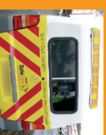
Cameras can be operated through the side and rear windows of the mobile enforcement vehicles.

Mobile cameras are at different locations each day.