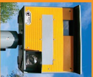
All safety camera sites are preceded by warning signs.

For more information visit www.suffolksafecam.co.uk